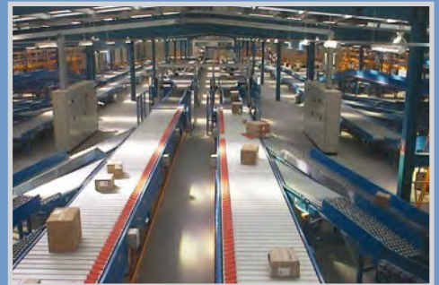
Automated warehousing identification systems