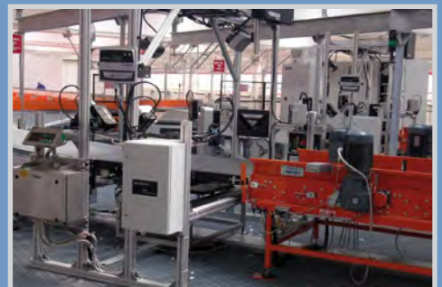
Postal/Courier parcel sorting and tracking