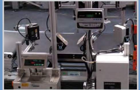
Airport baggage sorting systems